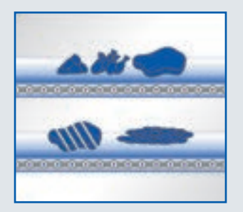
3. Forming, filling, labeling, packing